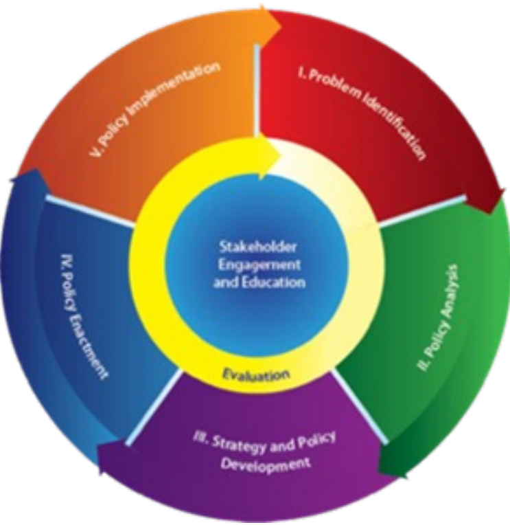
CDC Policy Process Cycle