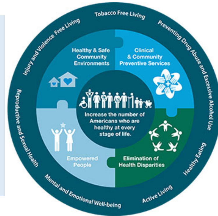
CDC Health in All Policies